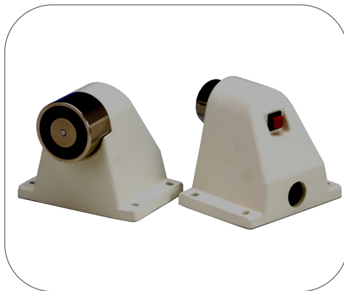
Floor Mount Door Holder