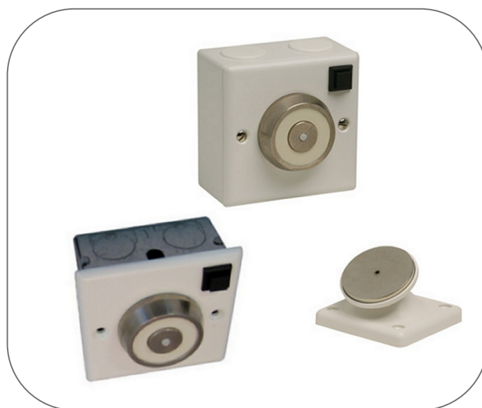
Flush Mount Door Holder