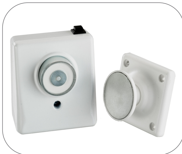
Surface Mount Door Holder – ABS Casing