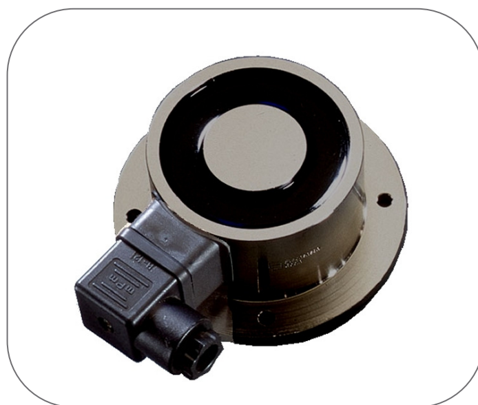
Surface Mount Door Holder